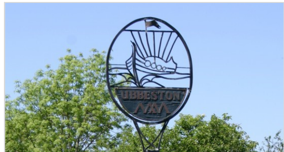
Ubbeston Village Sign