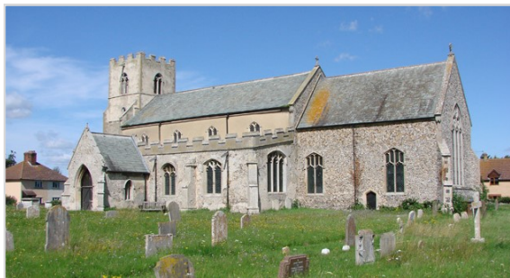
St Mary's Church in Tuddenham