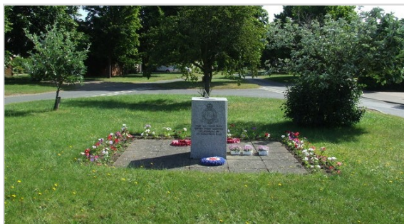
Tuddenham Village Green & War Memorial