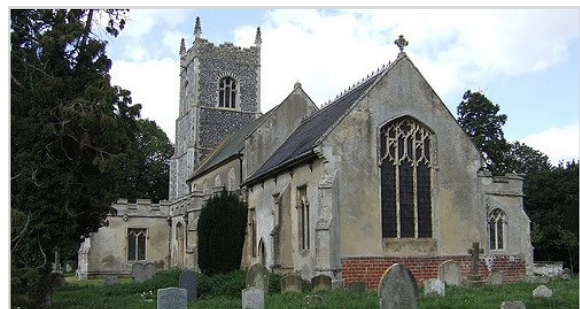
St Margaret's Church in Thrandeston