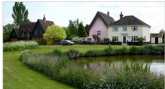
Village Green & Duck Pond in Thrandeston