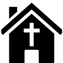
St Margaret's Church