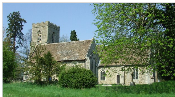
St Nicholas' Church in Thelnetham