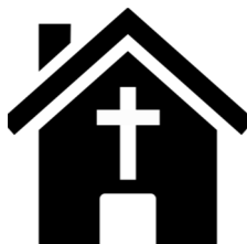
St Margaret's Church