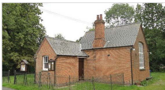
Ilketshall St Margaret Village Hall