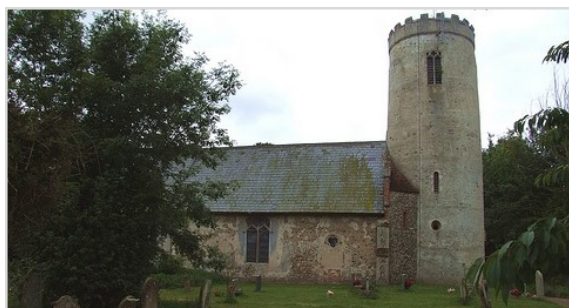
St Margaret's Church