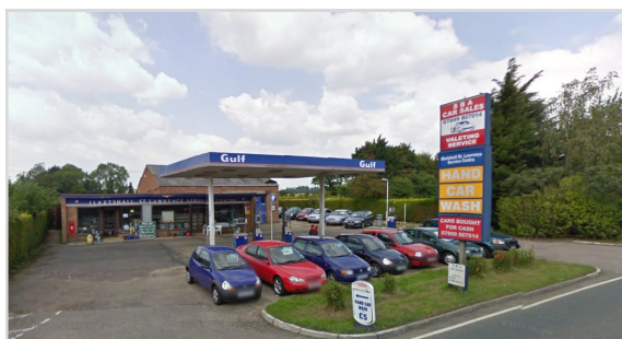
Service Station along Halesworth Road