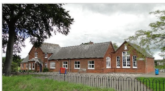
Ilketshall St Lawrence Primary School