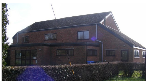
St James Village Hall