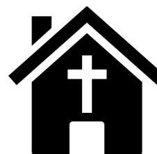
St James Church