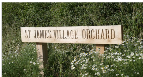
Sign outside St James Orchard Community Project