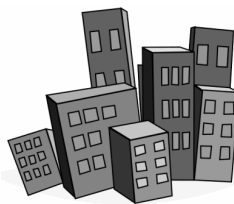
Semer Business Park Economy