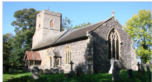
All Saints Church in Semer