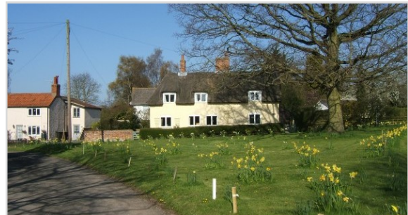
The Knoll in Rendham