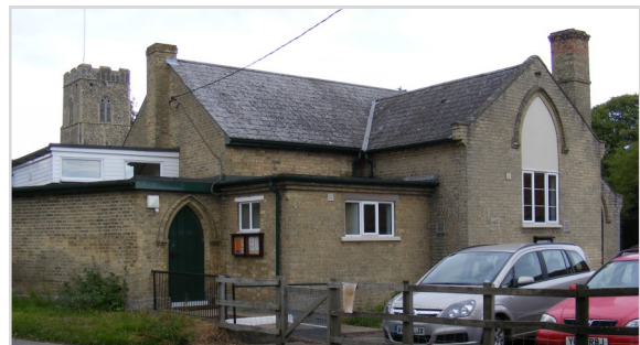
Rendham Village Hall