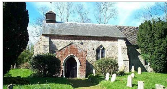
Church of St Peter in Redisham

Fun fact: Redisham is the childhood home of author, journalist and politician Martin Bell OBE. Having reported from over 100 countries and 18 warzones for the BBC, Martin moved into politics in 1997. He was elected as an the first independent MP since 1951.