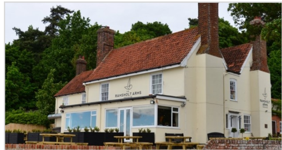
Ramsholt Arms at Ramsholt Quay