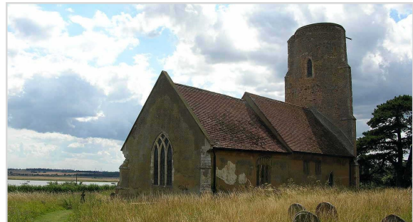
All Saints Church in Ramsholt