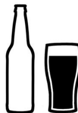
Ramsholt Arms Pub