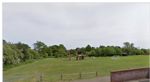
North Cove & Barnby Playing Fields