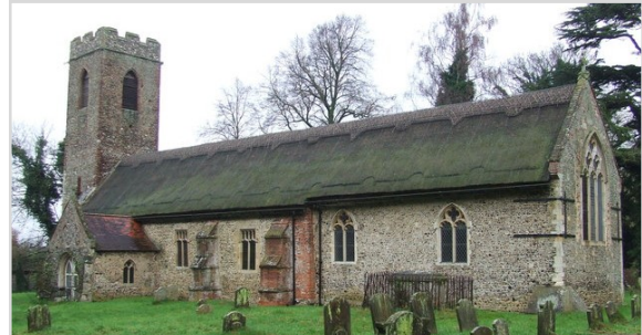
St Botolph's Church in North Cove