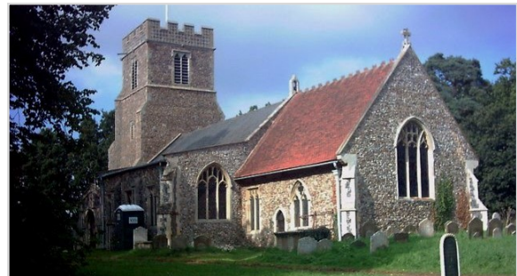
St Andrew's Church in Marlesford