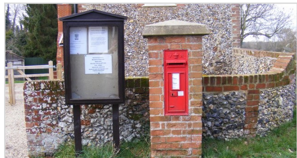
Post Box & Noticeboard in Marlesford