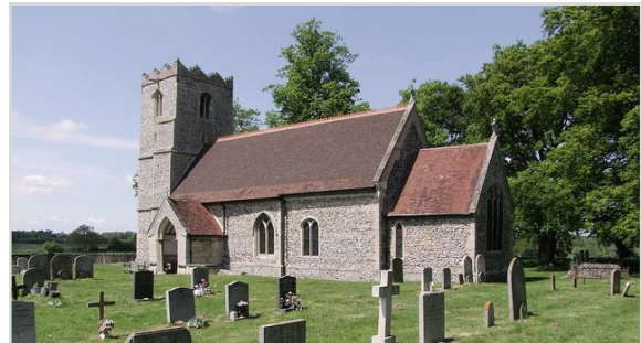
St Lawrence's Church in Lackford