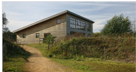
Suffolk Wildlife Trust Centre at Lackford Lakes