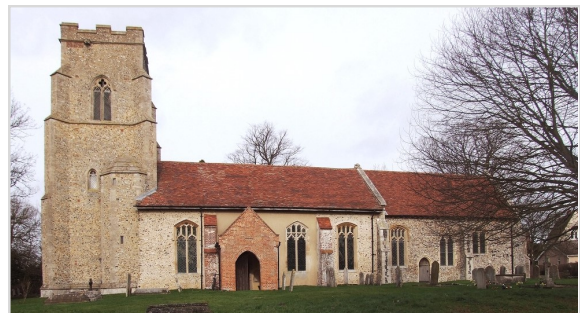
St Mary's Church in Kettlebaston