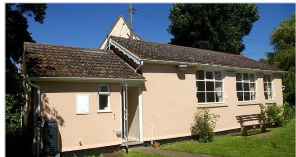
Kettlebaston Village Hall