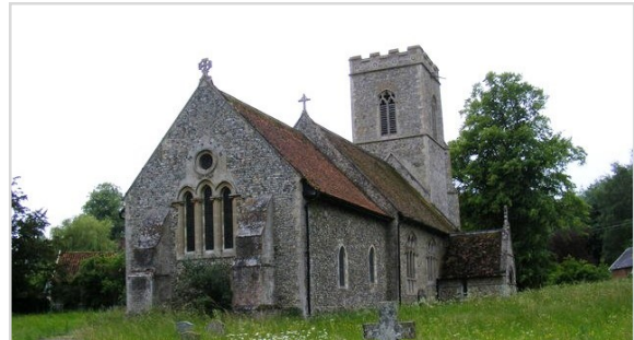
All Saints Church in Kenton