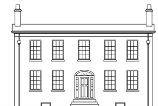
Kenton Hall Estate