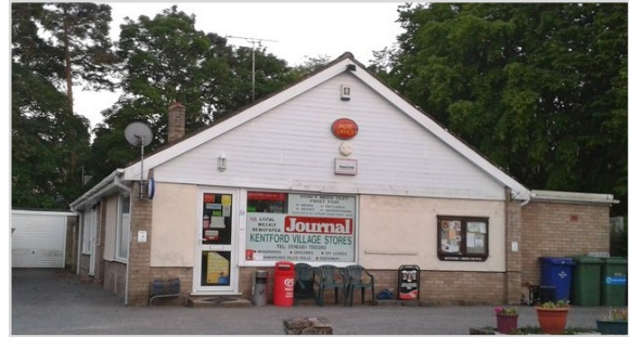
Kentford Post Office