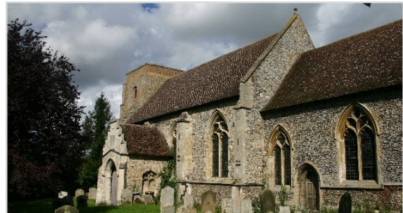
St Mary's Church in Kentford