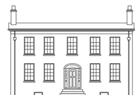
Helmingham Hall Estate