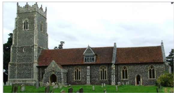
St Mary's Church in Helmingham