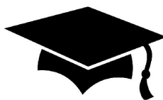
Helmingham Primary School Education