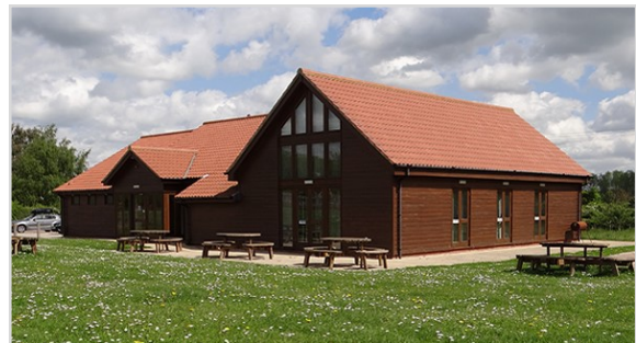
Hacheston Village Hall