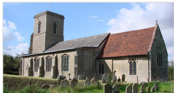
All Saints Church in Hacheston