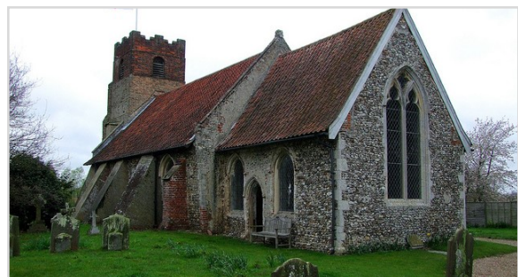
St Mary's Church in Farnham