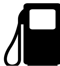
Stratford Service Station Local Services