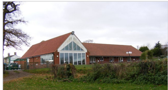
Riverside Community Centre in Stratford St Andrew