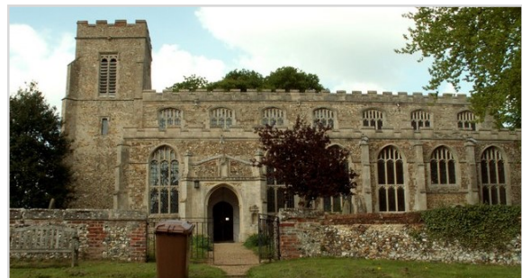
St Nicholas' Church in Denston