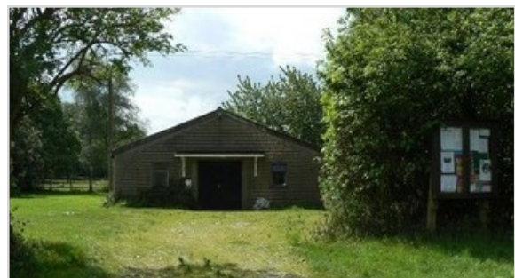
Denston Village Hall