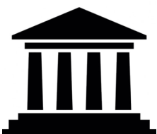
Denston Village Hall Community Building