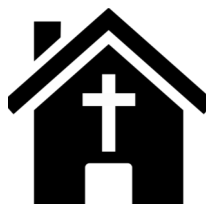
St Nicholas' Church Religion