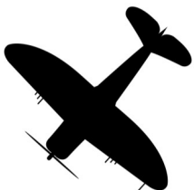
Debach Airfield Heritage