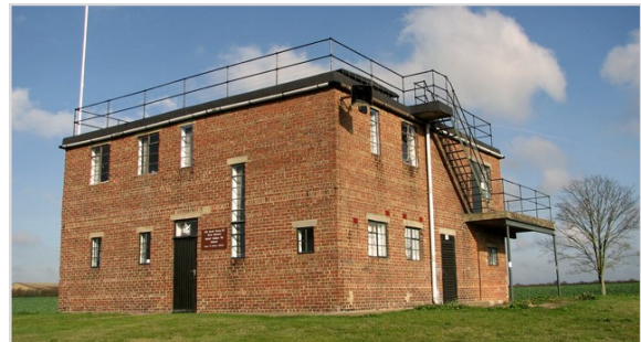
Debach Airfield Control Tower