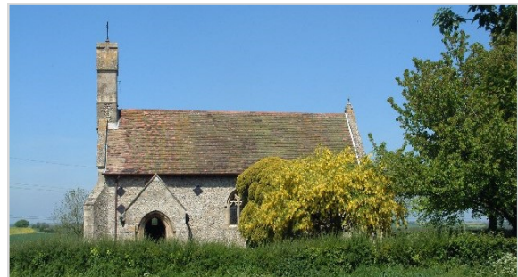
St Andrew's Church in Darmsden