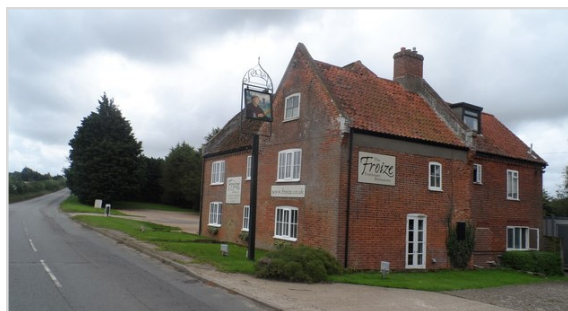
The Froize freehouse & Restaurant in Chillesford