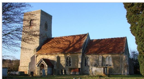
St Peter's Church in Chillesford