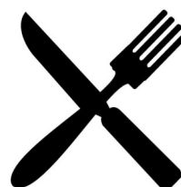
The Froize Restaurant