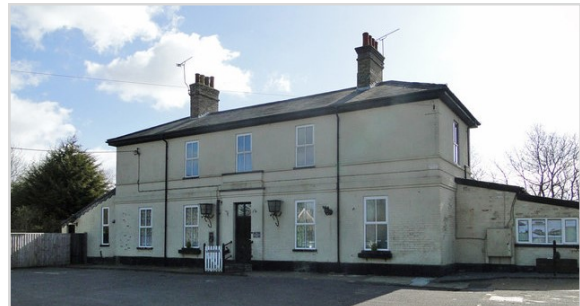
The Old Station House in Campsea Ashe