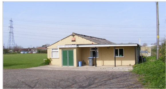
Campsea Ashe Village Hall