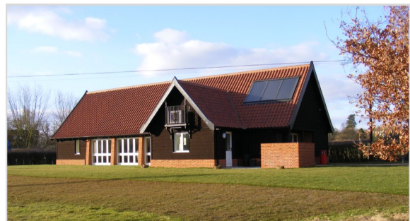
Bruisyard Village Hall