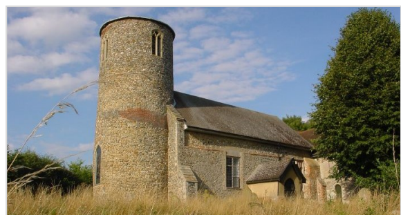
St Peter's Church in Bruisyard