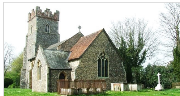
St Andrew's Church in Bredfield