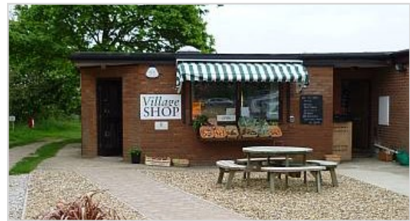
Bredfield Village Shop, adj. to Village Hall