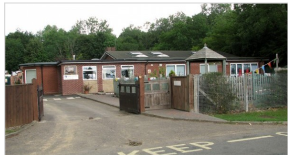
Brampton Primary School