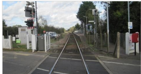
Brampton Railway Station