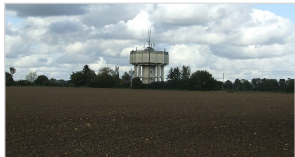
Water Tower in Bradfield St Clare