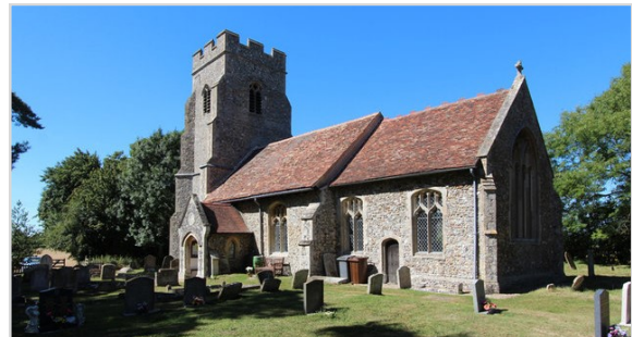
St Clare's Church in Bradfield St Clare