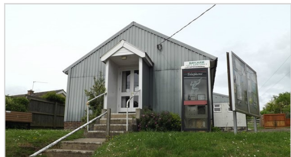
Baylham Village Hall