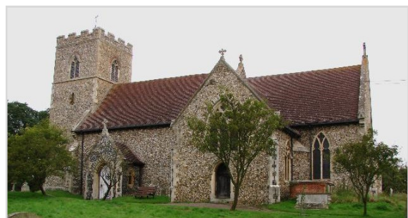
St Peter's Church in Baylham