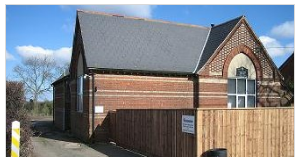
Battisford Village Hall