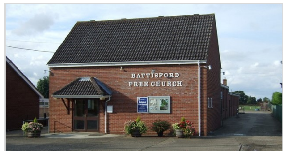
Battisford Free Church