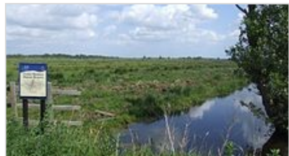
Barnby Broad and Marshes