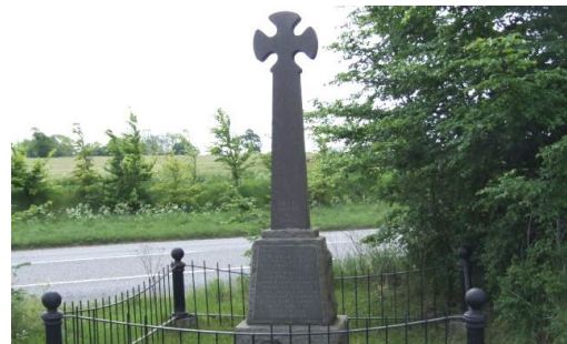
Barnby War Memorial