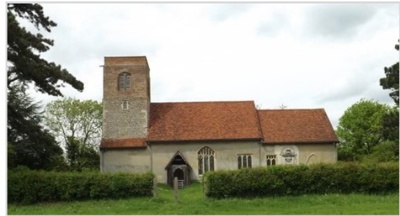
St Mary's Church in Badley