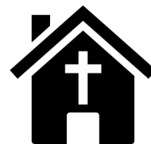
St John's Church