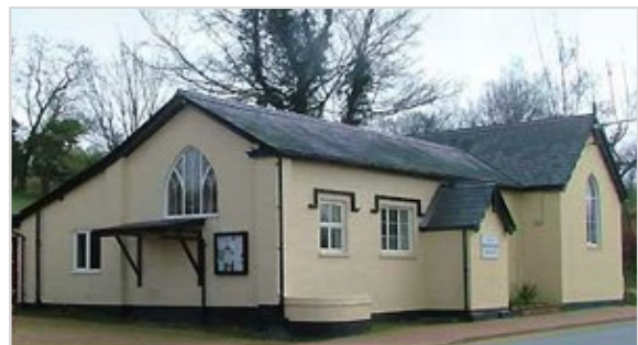
Badingham Village Hall