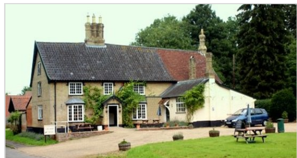
The White Horse pub in Badingham