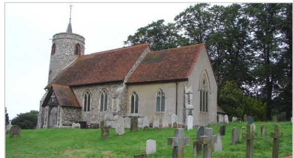
St Mary's Church in Aldham